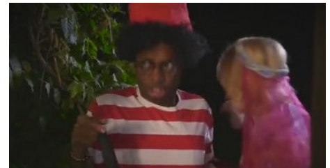
EVERY TRICK-OR-TREAT EVER